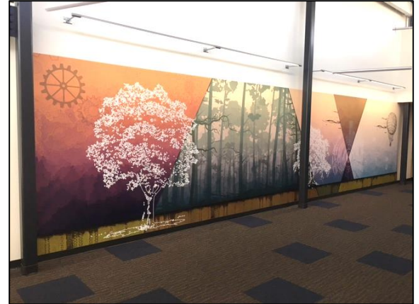
New Wall Mural