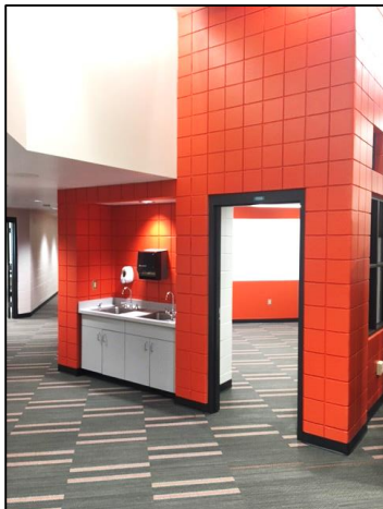
7 th Grade Small Group Space