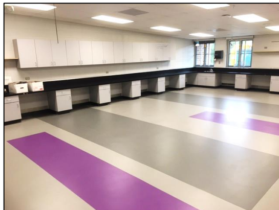
New 8 th Grade Lab Classroom Resilient Flooring