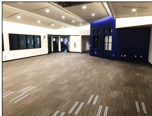
6 th Grade Large Group Space