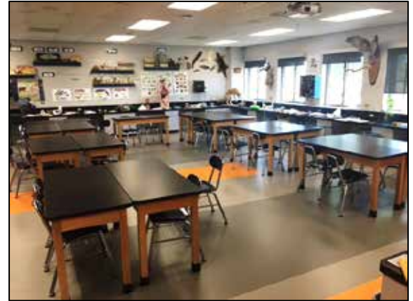
Completed resilient flooring installation in 6 th grade science room