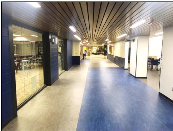
Decorative Wood Panels & Resilient Tile Flooring Installed