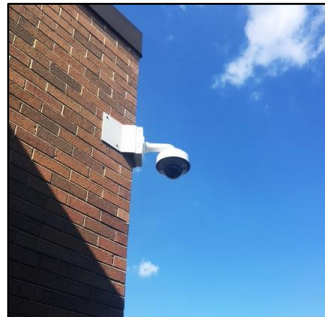
New Exterior Security Cameras