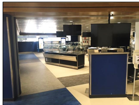
New Kitchen Servery Entrance