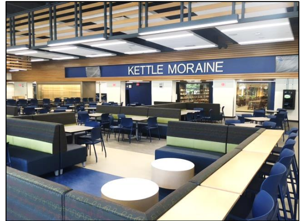
Completed Cafeteria Area